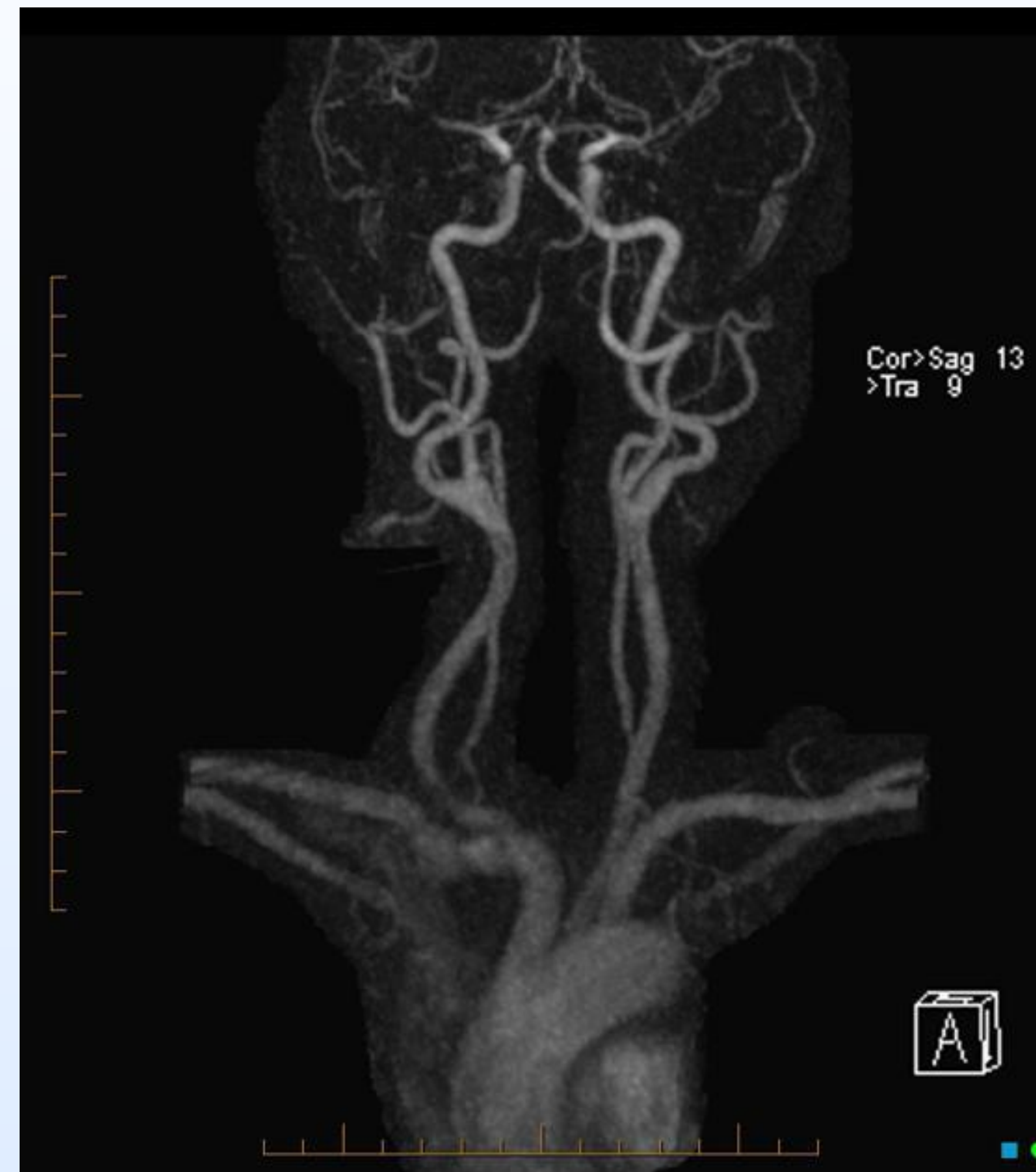
Figure 1. Right Vertebral Artery Dissection, MRA (Example Imaging)

She had a positive Romberg sign with unsteady gait leaning to left. Finger-to-nose and heel-to-shin tests were normal. She described a new onset of numbness in both upper extremities. All deep tendon reflexes were intact except the left Achilles reflex of 1/4. Nystagmus were present with left eye ptosis. She did not present with tremors or syncope. Amphetamine abuse in remission for the past 8 years.