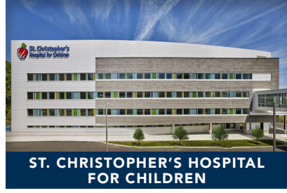
ST. CHRISTOPHER'S HOSPITAL FOR CHILDREN