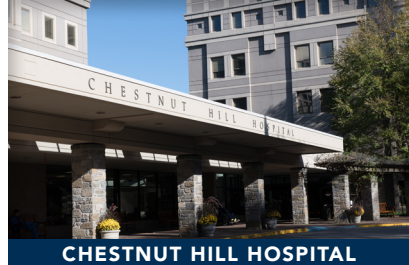
CHESTNUT HILL HOSPITAL